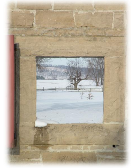
A view of the bluffs from Fort de Chartres.

I grew up in a rural community in Bond County, Illinois. Living in this area afforded me an opportunity to enjoy nature/outdoors from an early age. My maternal grandparents owned an 80-acre farm, which included wooded areas, a pond, and a creek. My siblings, cousins and I spent countless hours exploring the various areas on the farm. One day we might go hiking in the woods pretending to be explorers looking for lost treasure, and another day we may be trying to catch frogs or minnows. My paternal grandparents, as well as uncles, would take my cousins & I to local creeks for walks. We might stop and observe crayfish or small fish in a pool of water, or search a nearby rock formation for fossils. Growing up I also engaged in other outdoor activities including mushroom hunting, fishing, and hunting.