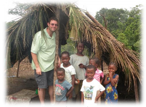
On a mission trip to Liberia.

One of the aims of Clifftop is educating the public on what significant natural resources we have in our area. Clifftop already offers great events such as Owl Prowls and Frog Frolics just to name a couple. Colleges and universities in the region conduct a variety of field studies at Clifftop natural areas. It is my hope that moving forward we can begin to offer professional development activities to local teachers as well as develop curriculum that can be utilized on class field trips to these natural areas.